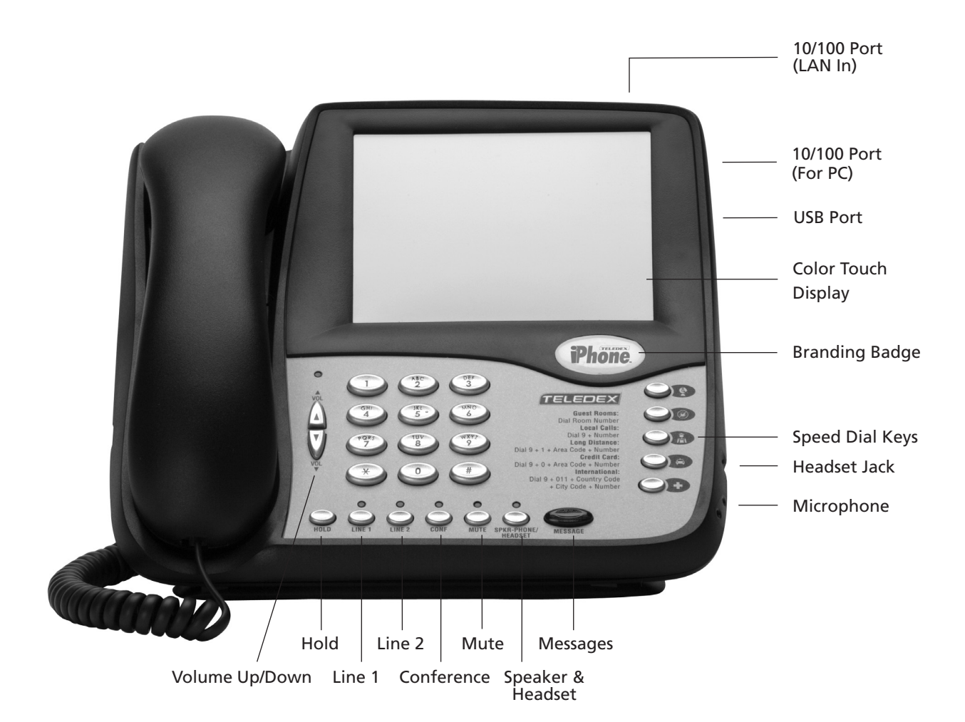
Fig 1: SIP LD Series Diagram

If you feel that the information contained herein does not represent the way your product is operating, check our website (www.teledex.com) for the latest version of this documentation.